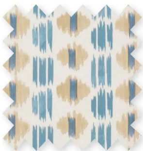
ABOVE Bandhani cotton in Aquifer, £38.59m, Iliv